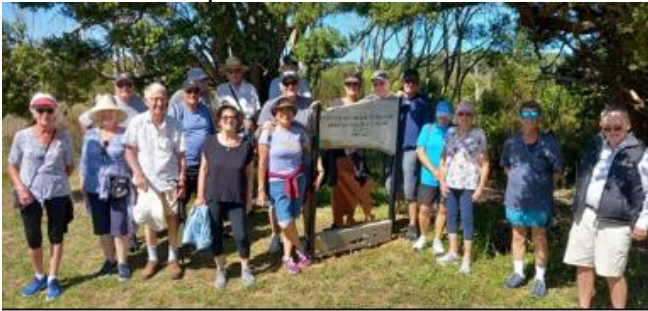
Waitoki 13 th January 2025

This week the Ramblers are heading back to a regular spot with a stroll around Orewa Estuary starting from Millies Café. Last week 15 hearty soles turned up for the walk around Hobsonville with various breakaway groups all finding their way back to the Catalina Café. The previous week 20 of us did a flat walk on a private track at Waitoki.