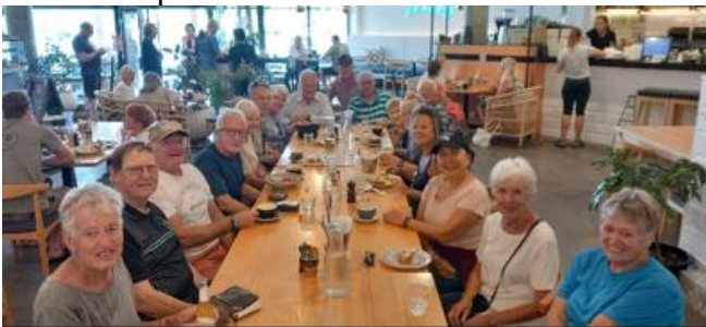
Hello Manly Café after 4 beaches walk

Last week we had an impressive group of 20 who took on the full 4 beach walk with some opting for the shorter walk. The walk started out from the Bridge Club at Edith Hopper Park, Ladies Mile and visited Manly Beach via Lawrence and Cross Streets to avoid the eclipse of Moths that had taken over part of the beach.