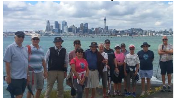
Sulphur Point before Christmas lunch